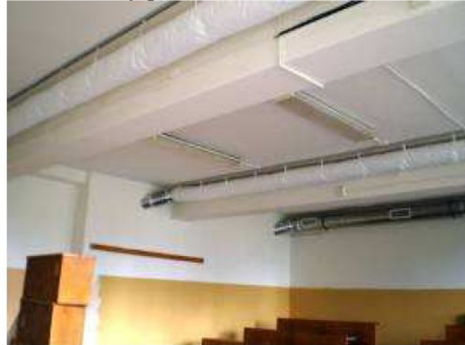
Foto ze třídy po realizaci